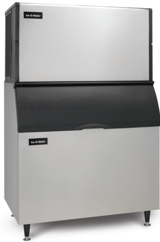
ICE2106 on B100