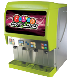
FUSION GREEN OPTIONAL

NOTE: PUMP & MOTOR ASSEMBLY MUST BE POSITIONED WITHIN 8 FEET OF THE DISPENSER