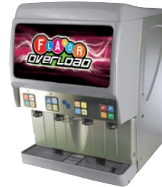
GUN METAL GRAY OPTIONAL