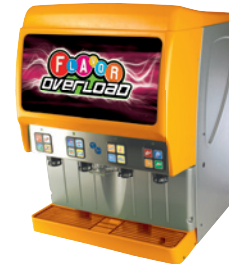
ORANGE DREAM OPTIONAL