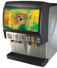
MIDNIGHT BLACK STANDARD

NOTE: PUMP & MOTOR ASSEMBLY MUST BE POSITIONED WITHIN 8 FEET OF THE DISPENSER