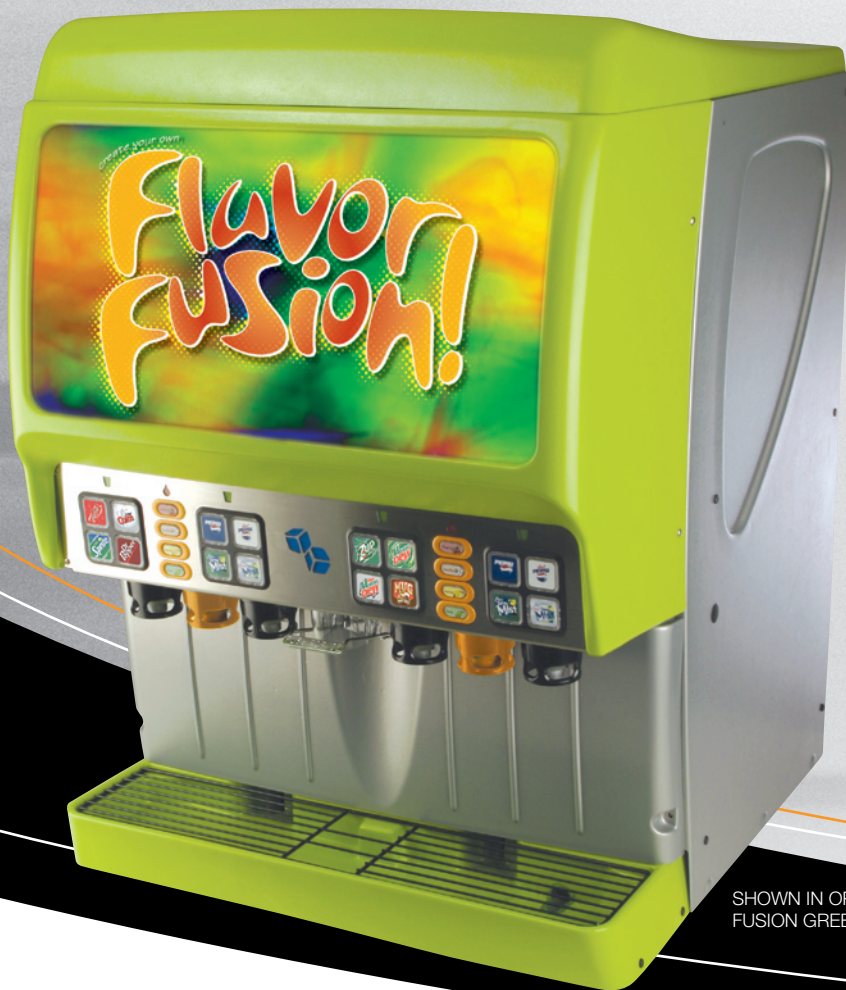
SHOWN IN OPTIONAL FUSION GREEN