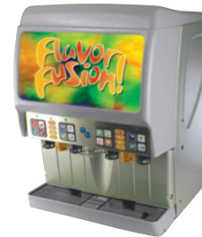
GUN METAL GRAY OPTIONAL