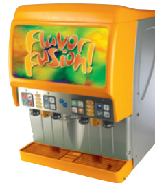
ORANGE DREAM OPTIONAL